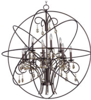
25147OI Orbit 12-Light Pendant