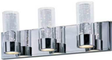
20903CLPC Sync LED 3-Light Vanity